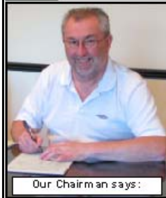
Our Chairman says:

58% OF FAMILIES THINK DIFFERENTLY ABOUT BAD LANGUAGE.