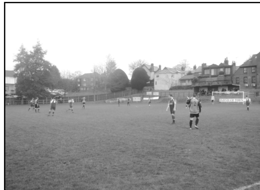
Farnham Town's quaint and historic West Street ground

In 2006/07 we were transferred over to the Combined Counties League, but Farnham had been relegated due to a sub-standard ground along with Horley Town. Horley bounced back straight away but Farnham took a little longer and finally returned as a result of their second place finish in 2010/11. We then met for a dull goalless draw in August and they are due to visit us on 11th February.